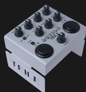
TEIL2 REVOLO · ARTISTA